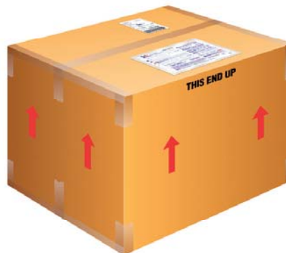
Use applicable routing label, airbill or address label